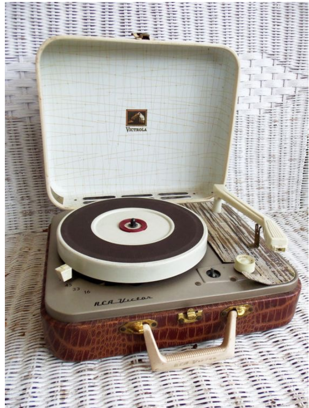
RCA Victor portable briefcase-style 45 player

Though what became known as the “single” and the “LP” were initially marketed as direct competitors, the various possibilities of the mediums led to different uses, and the two formats became the standard for the remainder of the vinyl era.